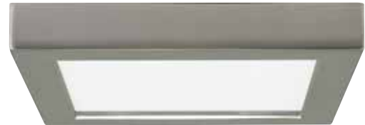
Brushed Nickel (BN)