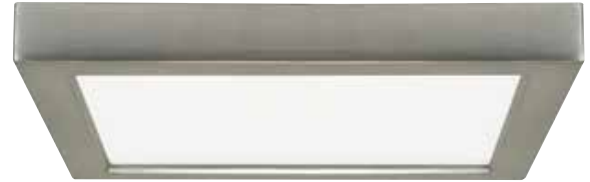
Brushed Nickel (BN)