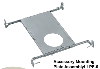
Accessory Mounting Plate Assembly LLPF-6