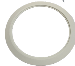
Accessory Goof Ring LL8542PR