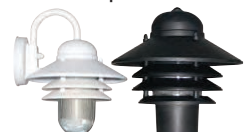
LLFN151 and LLFN252 Matching Wall Mount and Bollard Top

Recommended Dimmers for LWE/LCE: LEVITON IPL06-10Z, LEVITON 6674, LEVITON DECORA 6672, LUTRON DVCL-153P, LUTRON DIVA VCL-153P